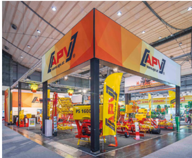
At the Dallein site in Waldviertel in Lower Austria, approximately 140 employees make a significant contribution towards preserving the environment

As an innovative company, naturally APV desires to play an important role on the market with its products. Together with customers around the world, APV refines its products on an ongoing basis.